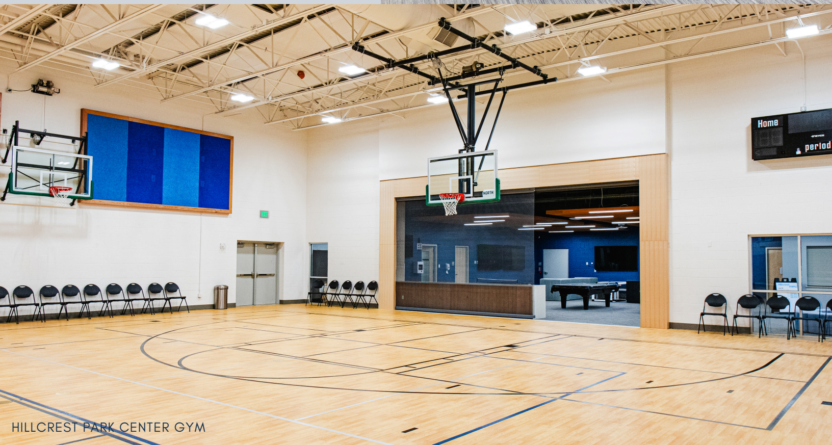
HILLCREST PARK CENTER GYM