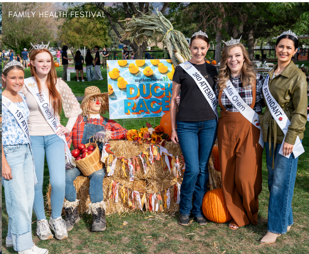
FAMILY HEALTH FESTIVAL