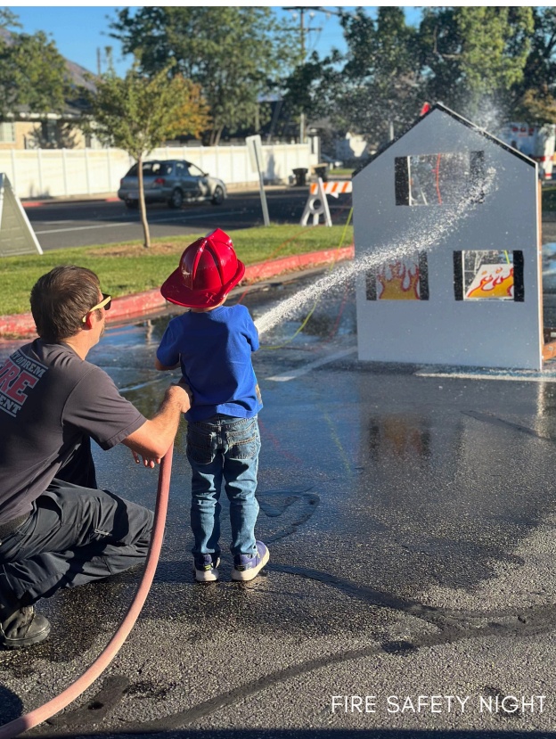
FIRE SAFETY NIGHT

OUR ANNUAL HALLOWEEN EVENT AT UNIVERSITY PLACE MALL. COME AND SEE ALL THE VEHICLES THAT KEEP A CITY ROLLING. DRESS IN YOUR COSTUME AND COME AND GET SOME TREATS! FIRE TRUCKS, DUMP TRUCKS, POLICE CARS, GARBAGE TRUCKS, AND SO MUCH MORE! THERE WILL BE A SENSORY HOUR FROM 10-11AM FOR THOSE WHO NEED A LITTLE LESS STIMULATION.