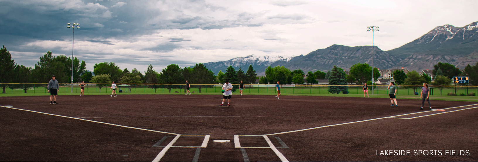
LAKE SIDE SPORTS FIELDS