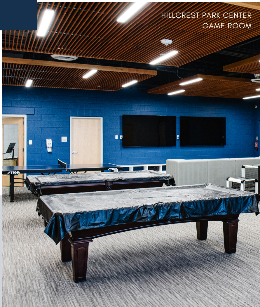
HILLCREST PARK CENTER GAME ROOM